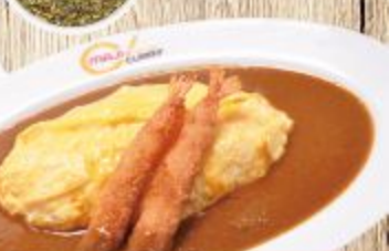
Omelet Curry with Fried Prawn R $16.25 / L $18.45 / XL $21.95