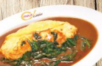
Omelet Spinach Curry R $14.75 / L $16.95 / XL $20.45