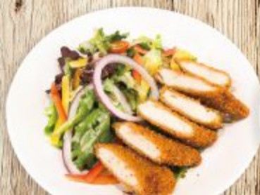
Chicken Cutlet Salad