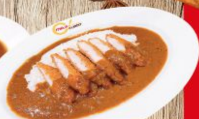
Chicken Cutlet Curry