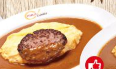
Omelet Curry with Hamburger Steak R $17.50 / L $19.70 / XL $23.20