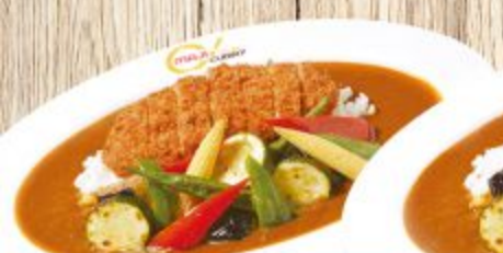
Pork Cutlet Veggie Curry