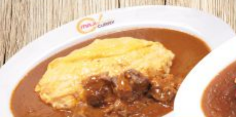
Omelet Beef Curry R $17.00 / L $19.20 / XL $22.70