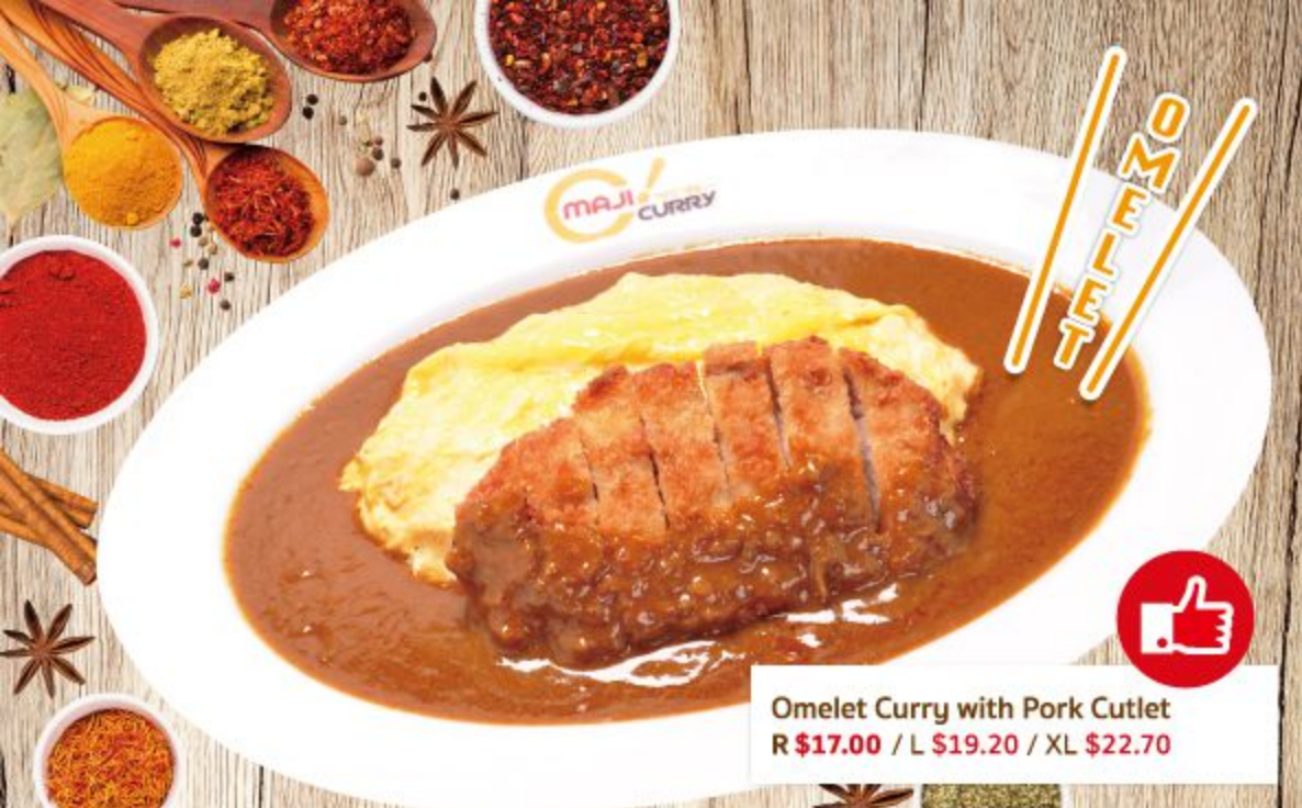
Omelet Curry with Pork Cutlet R $17.00 / L $19.20 / XL $22.70