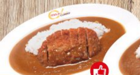
Pork Cutlet Curry