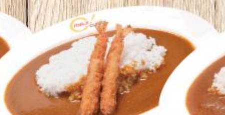
Fried Prawn Curry (2pcs)