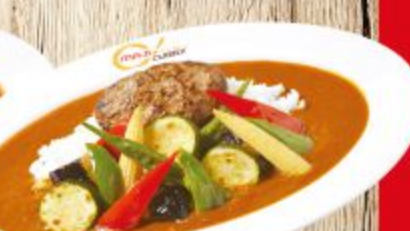
Hamburger Steak Veggie Curry