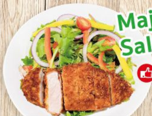
Pork Cutlet Salad