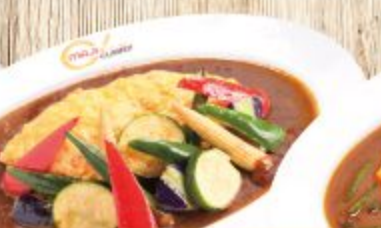
Omelet Veggie Curry R $16.25 / L $18.45 / XL $21.95