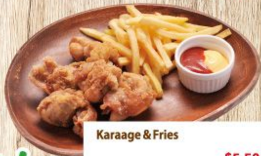
Karaage & Fries