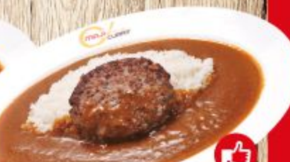
Hamburger Steak Curry