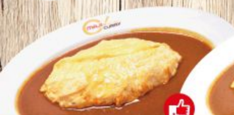
Omelet Curry R $12.25 / L $14.45 / XL $17.95